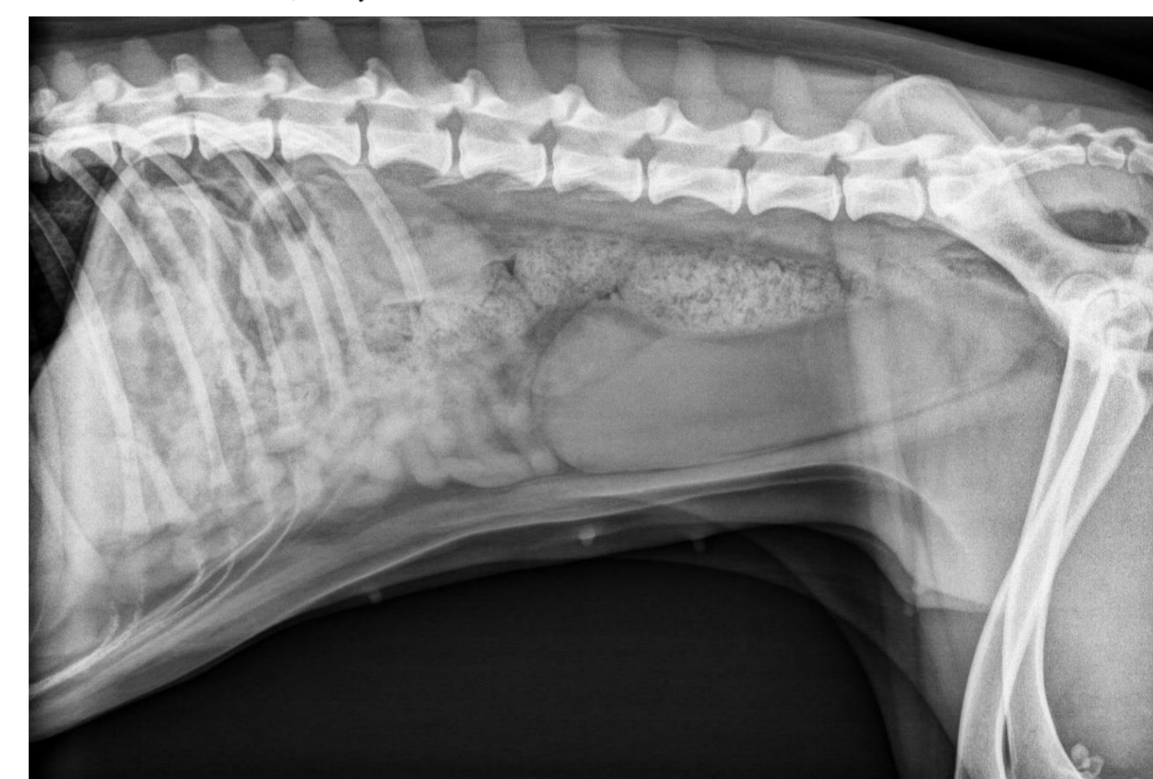
Pic.3: X-Ray Abdomen of Edda, enormous bladder